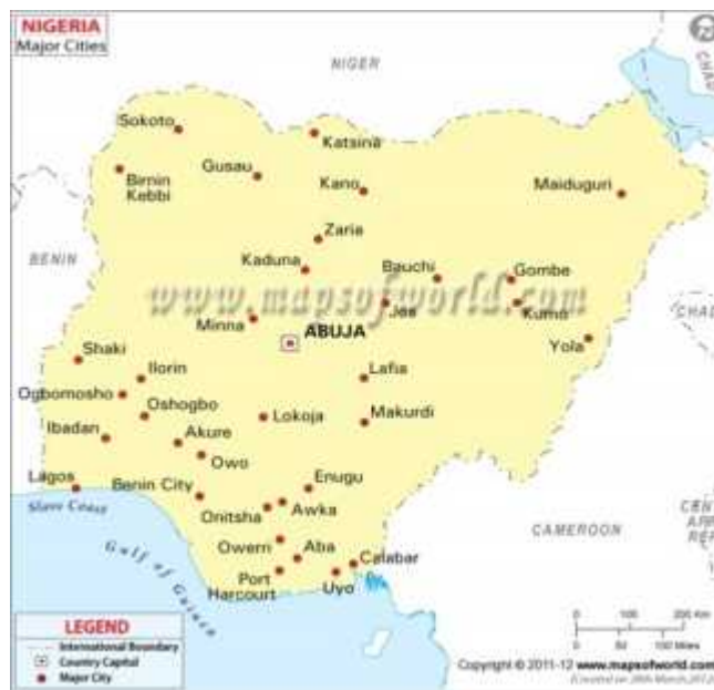
Figure 1: Map of Nigeria showing the States

development plans) of the Federal Government were further reinforced by the windfall gains from crude oil boom of the 1972/73 and 1979/80 periods (Ajakaiye, 1990). However, despite series of deregulation policies introduced since 1986 by successive governments to facilitate industrialization process in an economically conducive manufacturing environment, the performance of the industrial sector remains undesirable. In the last two decades, Nigeria recorded an unremarkable economic performance especially in manufacturing industry in the areas of production and international trade (Hayashi, 1996). Besides, lack of knowledge and mining of minerals might have largely contributed to such unfavorable performance of the industrial (manufacturing) sector. Regardless of the numerous constraints facing the industrial sector, the country still has some hope in the sector in propelling the necessary economic diversification from risk and uncertainty of the mining sector. On the trade front, historically, industrial development in Nigeria ties squarely with the developed countries from both the east and the west. Currently, the country is a member of the ECOWAS and has been affiliated to the World Trade Organization (WTO).